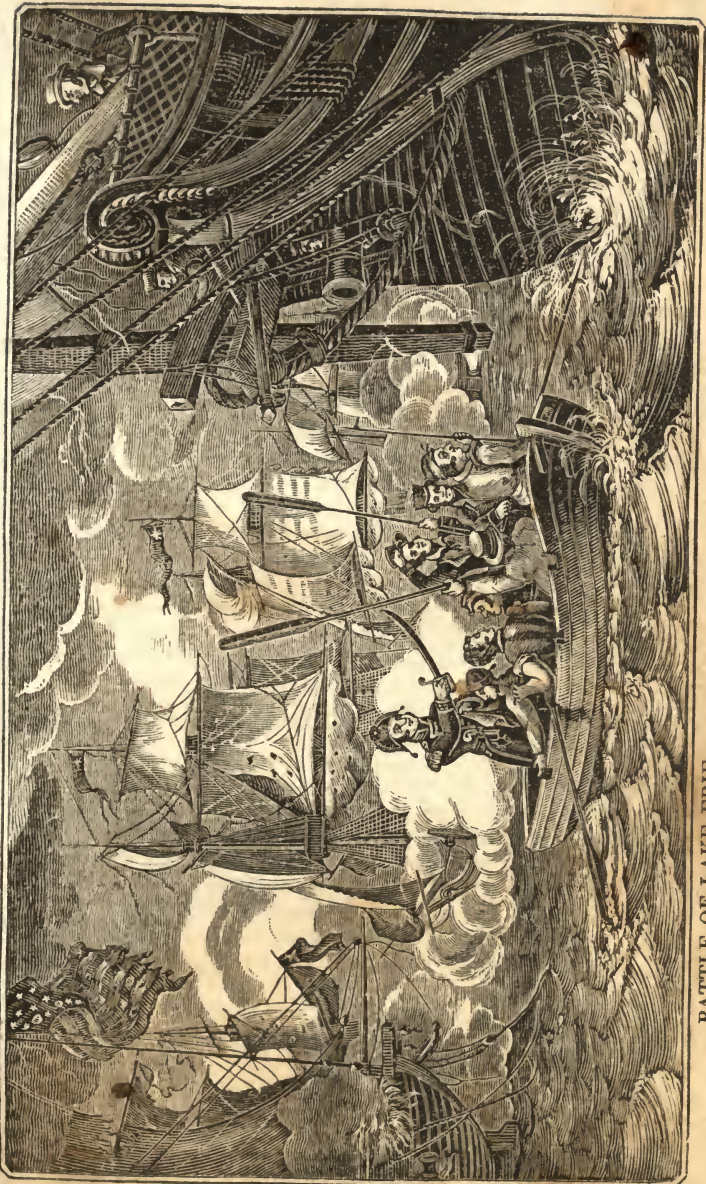
BATTLE OF LAKE ERIE..... COMMODORE PERRY.